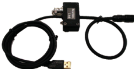
Computer remote control